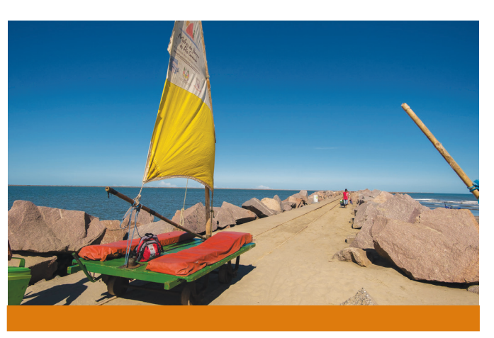
Breakwaters of Barra do Rio Grande: located at the Cassino beach, it is considered the world's third largest naval engineering work.