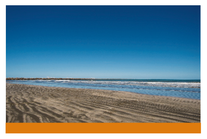
Cassino Beach: popularly known as the world's longest beach, it was so acknowledged by the Guinness Book of Records in 1994.