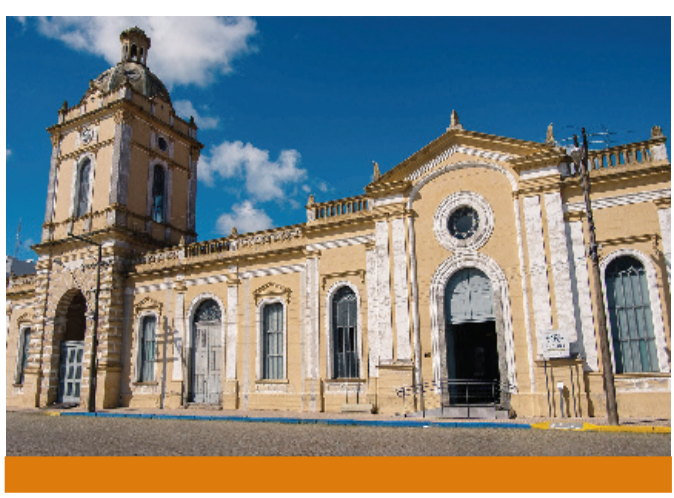
Customs House: one of the state's most remarkable buildings.