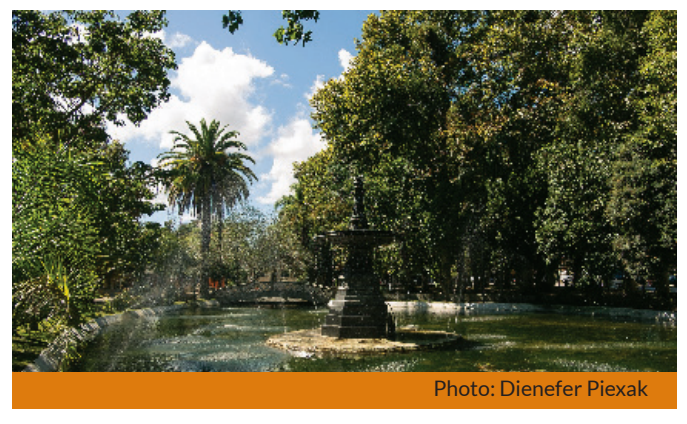
Tamandaré Square Fountain , one of the state's largest squares.

Saint Peter's Cathedral: the oldest religious temple in the state, declared a national heritage by the National Institute of Historic and Artistic Heritage.