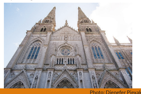
Our Lady of Mount Carmel Church: built in neogothic style.

Rio-Grandense Library: founded on August 15, 1846 as Gabinete de Leitura (Reading Room), it is one of the city's greatest cultural attractions, displaying almost 500.000 oeuvres, one of the country's largest collection.